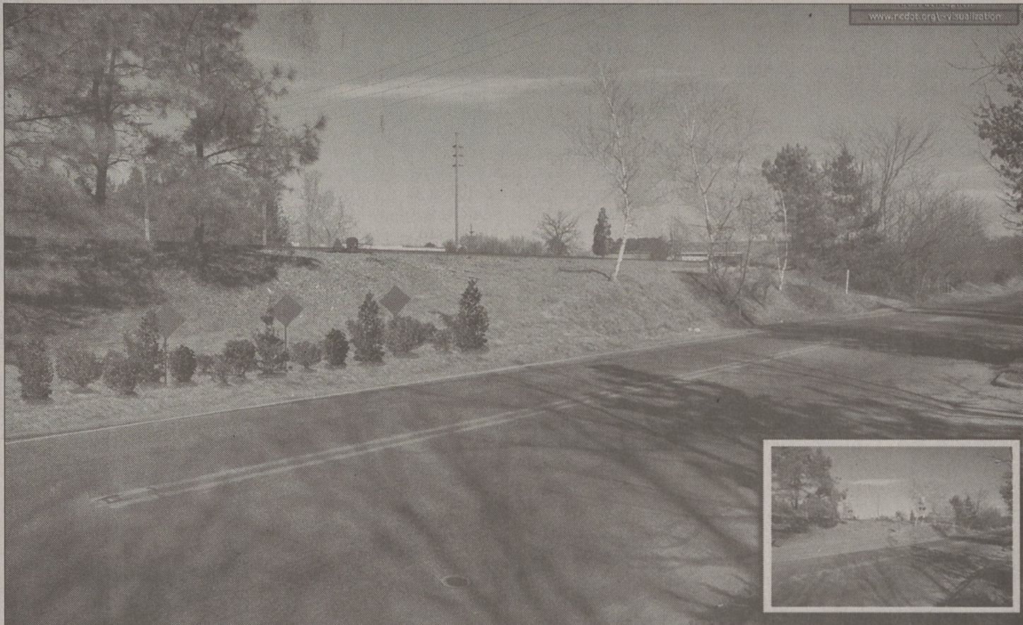
This is a State DOT artist's conception of what the Hawthorne Street railroad crossing would like like if it is closed. The angle is from the Battleground Avenue side of the railroad track.