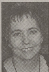
Andie Brymer Staff Writer

What has Farrah Fawcette been up to lately?