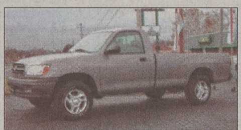
2002 TOYOTA TUNDRA #G4252A, Extra Clean, Automatic *12,990