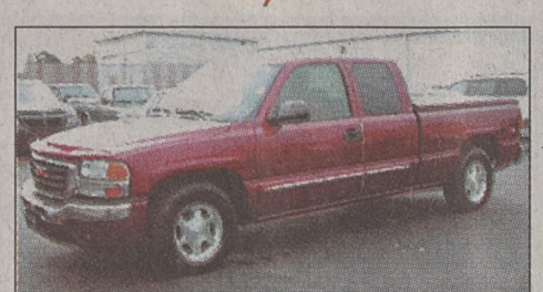
2004 SIERRA #B5123A, 3,500 Miles, Must See, Many Extras! *22,990