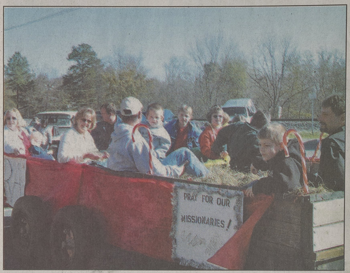
Young people from Bethany Baptist took part in Saturday's parade in Grover.