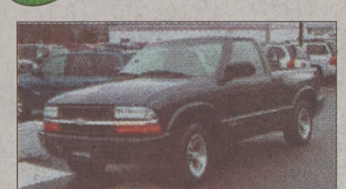
2000 XTREME #AX349A, S-10, Auto, Sporty Truck *9,900