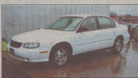
2004 CHEVÝ MALIBU #AX353, White, Low Miles *11,990