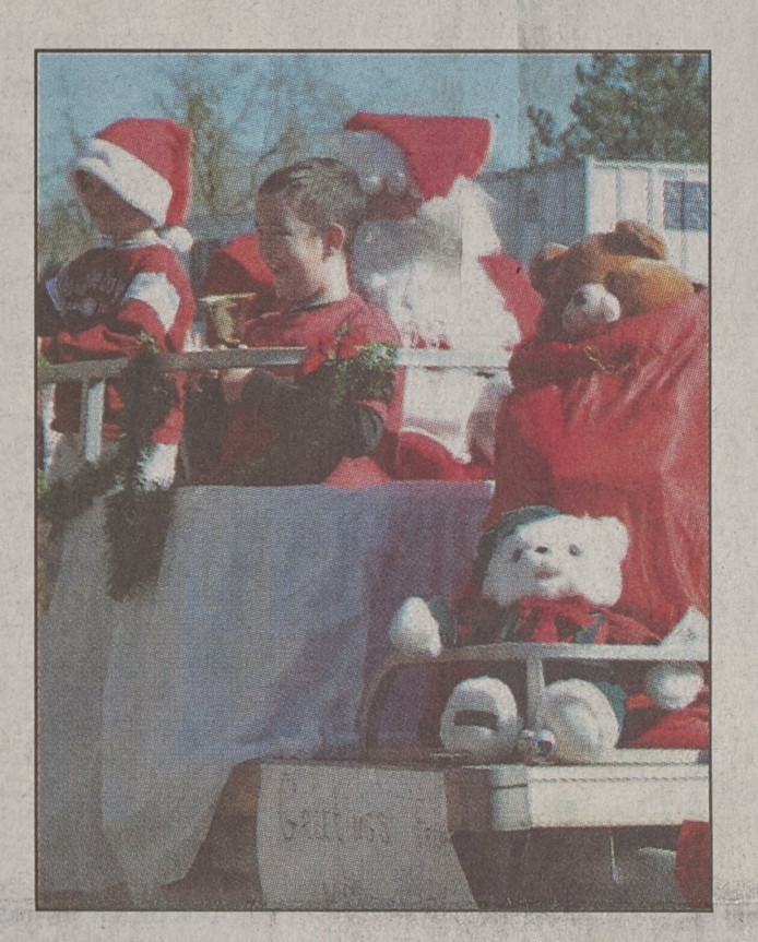
Santa and his helpers wave to the crowd Saturday during the Grover Christmas parade.

Church youth groups, a contingent of four wheelers, business representatives, a clown, members of the Grover Lions and Women's clubs and the Mecca Temple Salem Grand Shrine in Bessemer City tossed candy. Kids scrambled to pick up the peppermint disc, red hots and if lucky, the occasional tootsie roll.