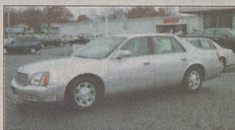
2002 CADILLAC DEVILLE #AC261, Silver, 35K Miles, Clean! $19,990