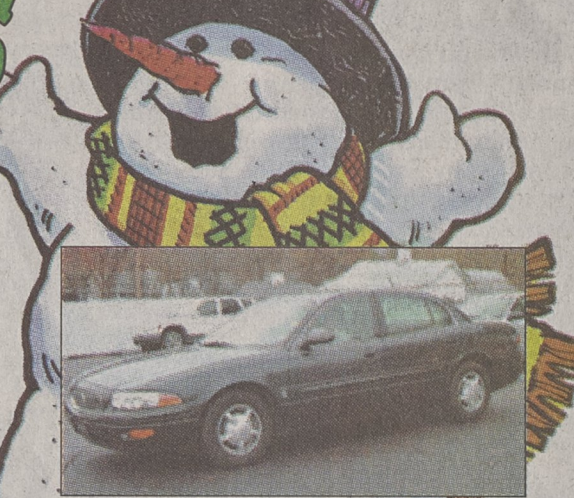
2000 BUICK LESABRE #B5117A, 1 Owner, Leather, Loaded *10,990