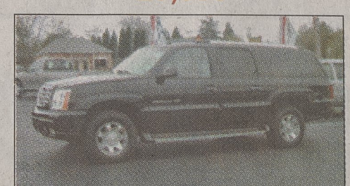
2003 ESCALADE ESV #X698, Loaded, Black, Low Miles $44,990

*Price does not include tax, tag and $249.50 doc fee.