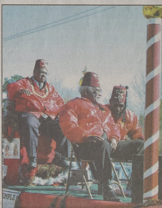
Shriners from the Mecca Temple Salem Grand Shrine in Bessemer City were part of the Grover Christmas parade Saturday.