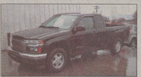
2004 GMC CANYON #P5119A, Bedliner, Sport Grill, 5 Spd.