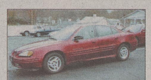
2001 GRAND AM #AP350, Auto, Burgundy *8,900