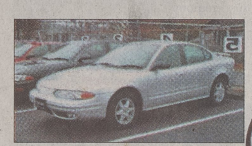
#AX352, Low Miles, Silver *10,990