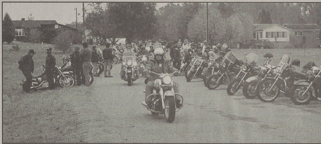
Hundreds of bikers participated in the 10th annual Murphey's Scooter Shed Toy Run recently. The run raises toys and animals for children in Oxford Home for Children and the Shrine Hospital.