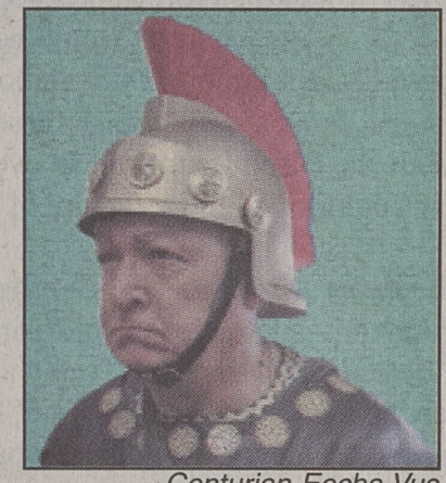
Centurian Eecha Vus

"I needed a diversion... and going after that Jewish troublemaker fit me just fine." stated the Centurion. However, just two days after Eecha Vus nailed Jesus to the cross, the Centurion is facing charges of losing the body he put to death.