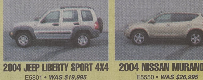
E5801 • WAS $19,995