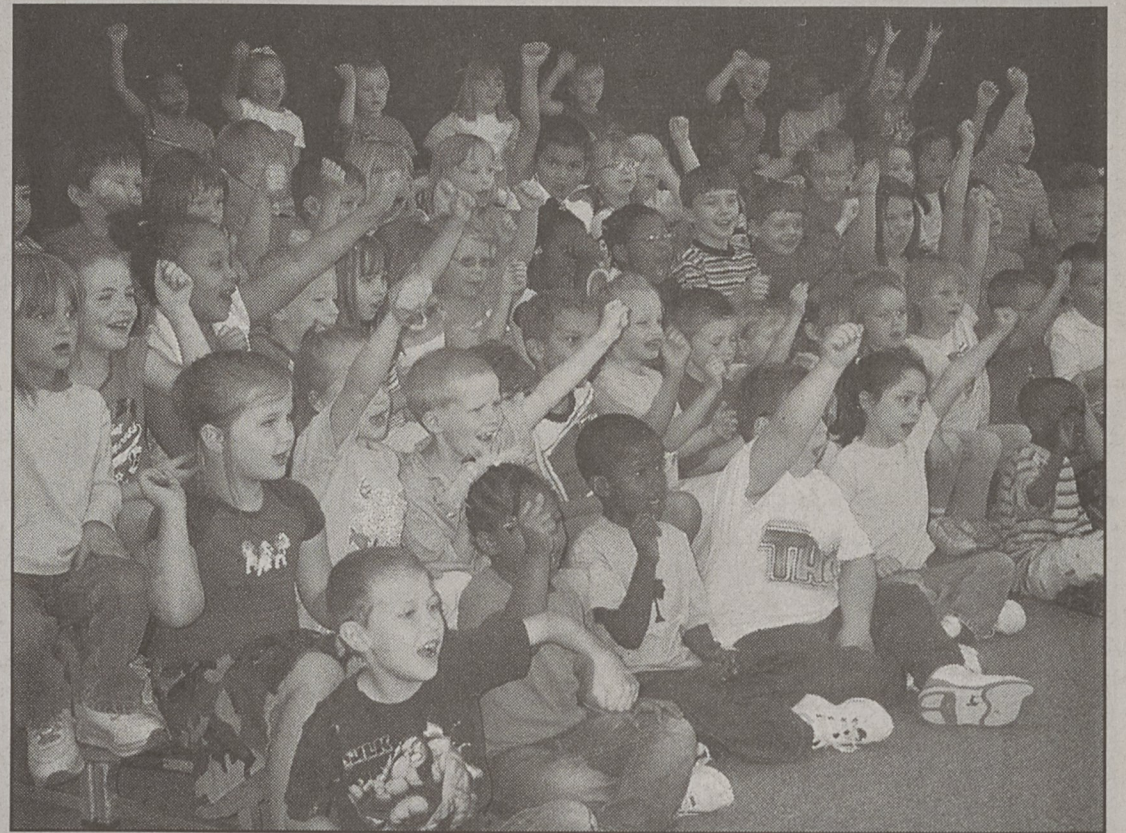
Bethware Elementary kindergartners sing during a volunteer luncheon Friday.