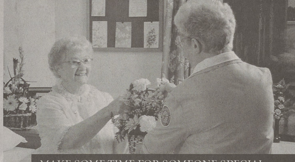
MAKE SOME TIME FOR SOMEONE SPECIAL.

When it comes to making a patient smile, delivering hope with a colorful bouquet of flowers, or being the listening ear that truly takes the time, our volunteers make all the difference at Cleveland Regional Medical Center and Kings Mountain Hospital.