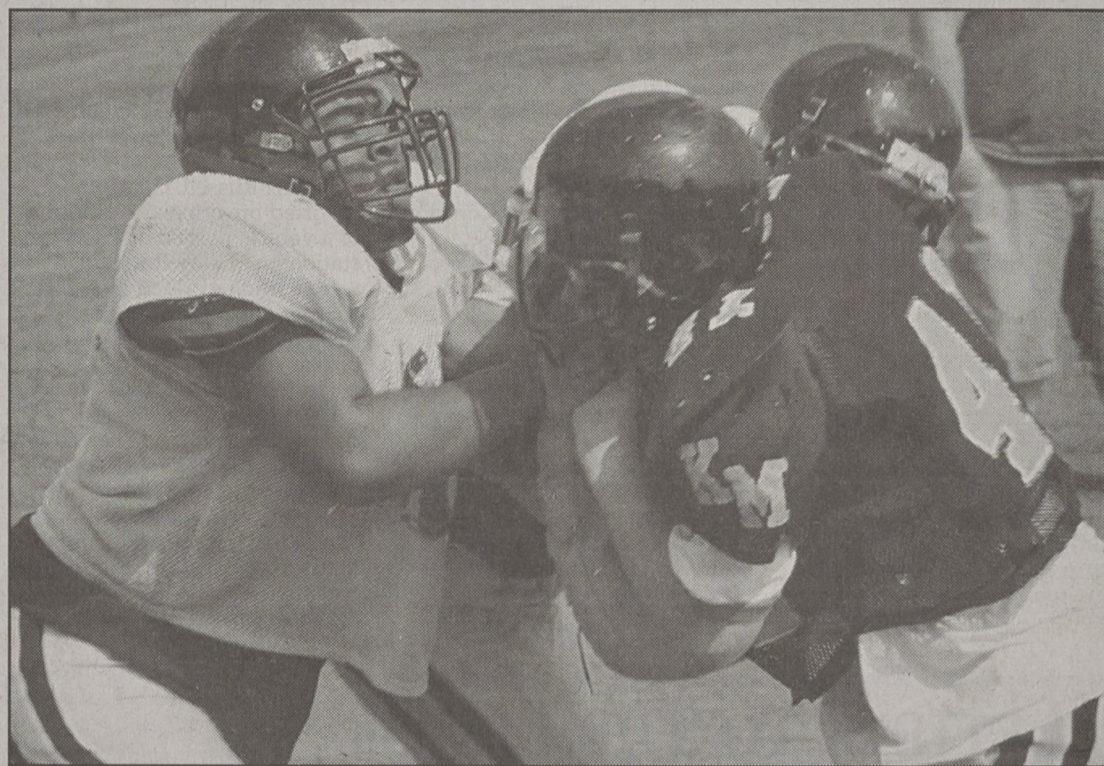
Kings Mountain High linemen work on blocking techniques in preparation for Friday's Cleveland County Jamboree at John Gamble Stadium.

Burns, which hosted the Cleveland County Jamboree last season, will bring one of the most explosive offenses in the area into Gamble Stadium. The Bulldogs are