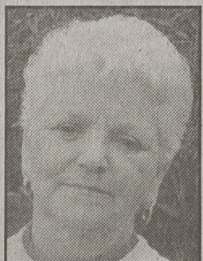
Pat Childers Arts

Crowders Mountain State Park will host "Winter Animal Survival: Suited for the Season" Sun., Nov. 13 at 2 p.m. Learn about how different animals protect themselves from the cold weather. Meet at the visitor center classroom, then venture outside from there. Dress appropriately for the weather.