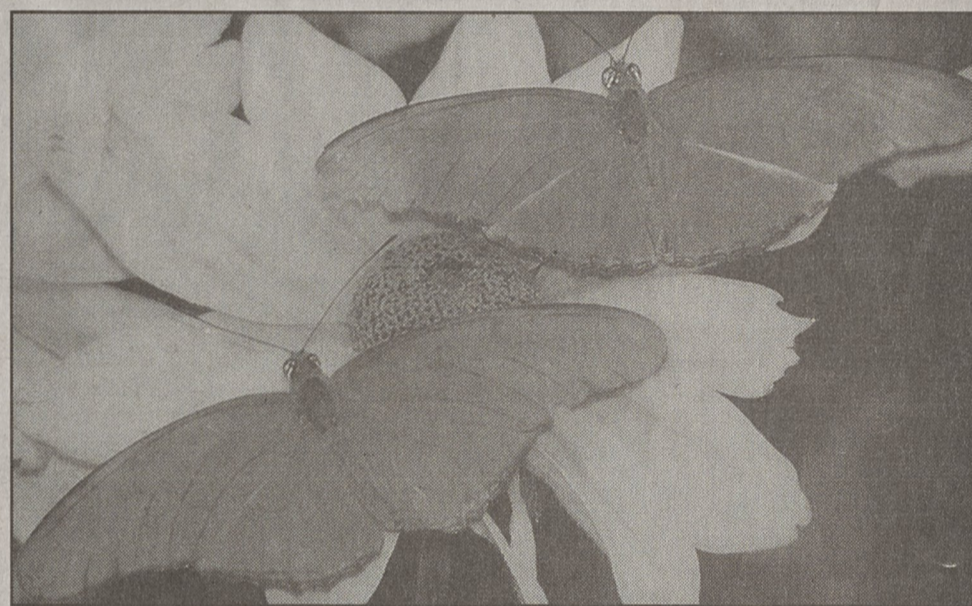
Butterfly farm in Aruba

"I want to share different ways people can enjoy national parks and how they can take good pictures even on days with bad weather," Carey said of his photographs of the Blue Ridge