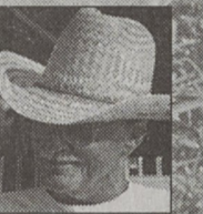
GUEST (10-5, 60-30)