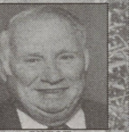
GUEST (8-7, 111-54)