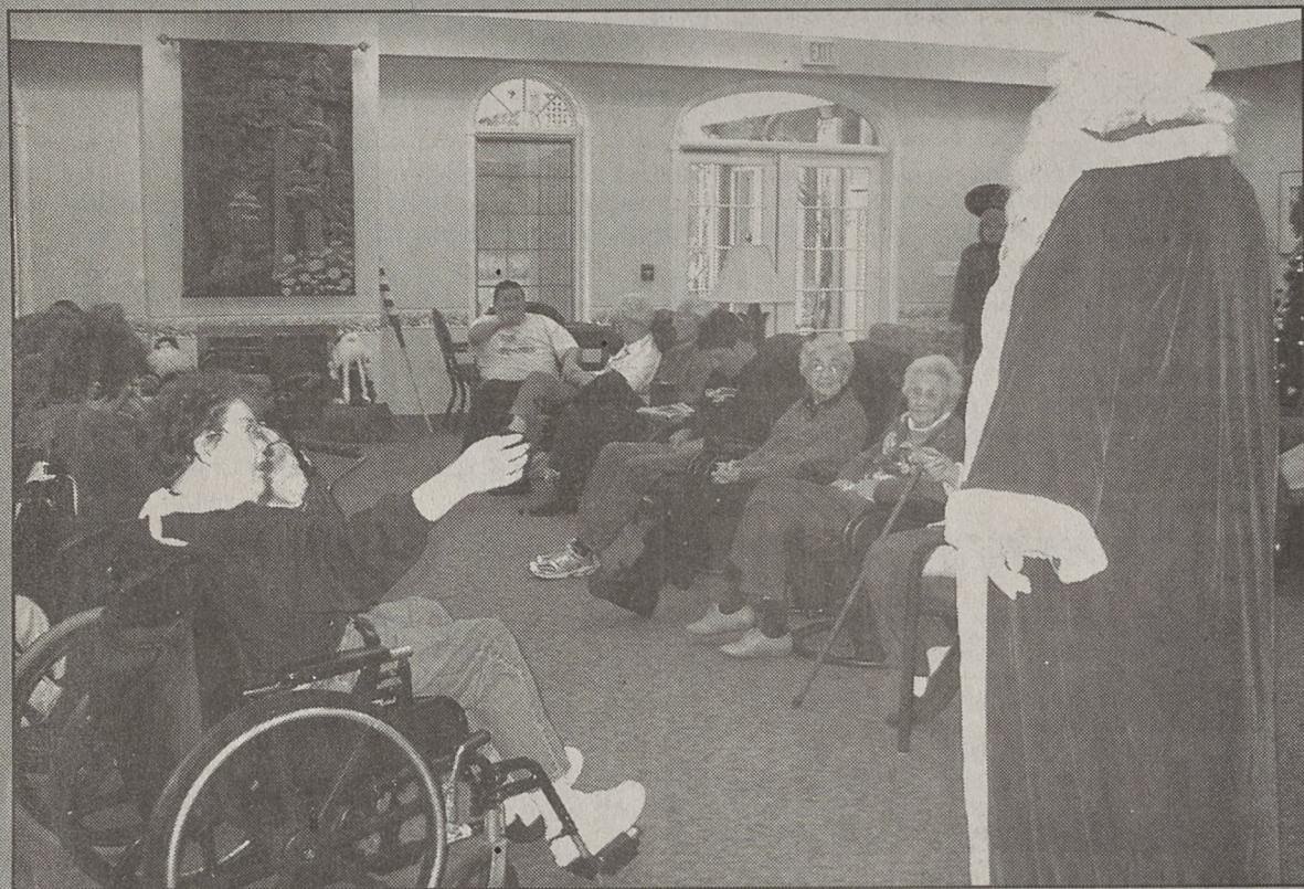
Santa Claus visited the Life Enrichment Center on Thursday with sacks of presents for the participants who made dolls this year for needy local children. They were all happy to see him.