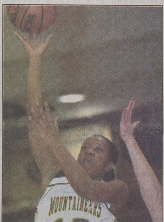
JOSEPH BRYMER / HERALD