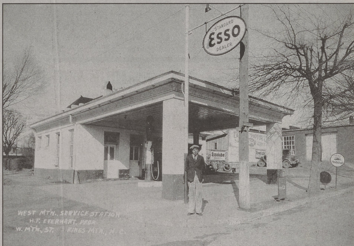
This picture shows the West Mountain Service Station at the corner of West Mountain Street and City Street in 1939 or 1940. Standing in front of the station is proprietor Fulton Everhart. The building in the background is the rear of the old Chevrolet dealership that faced Railroad Avenue.