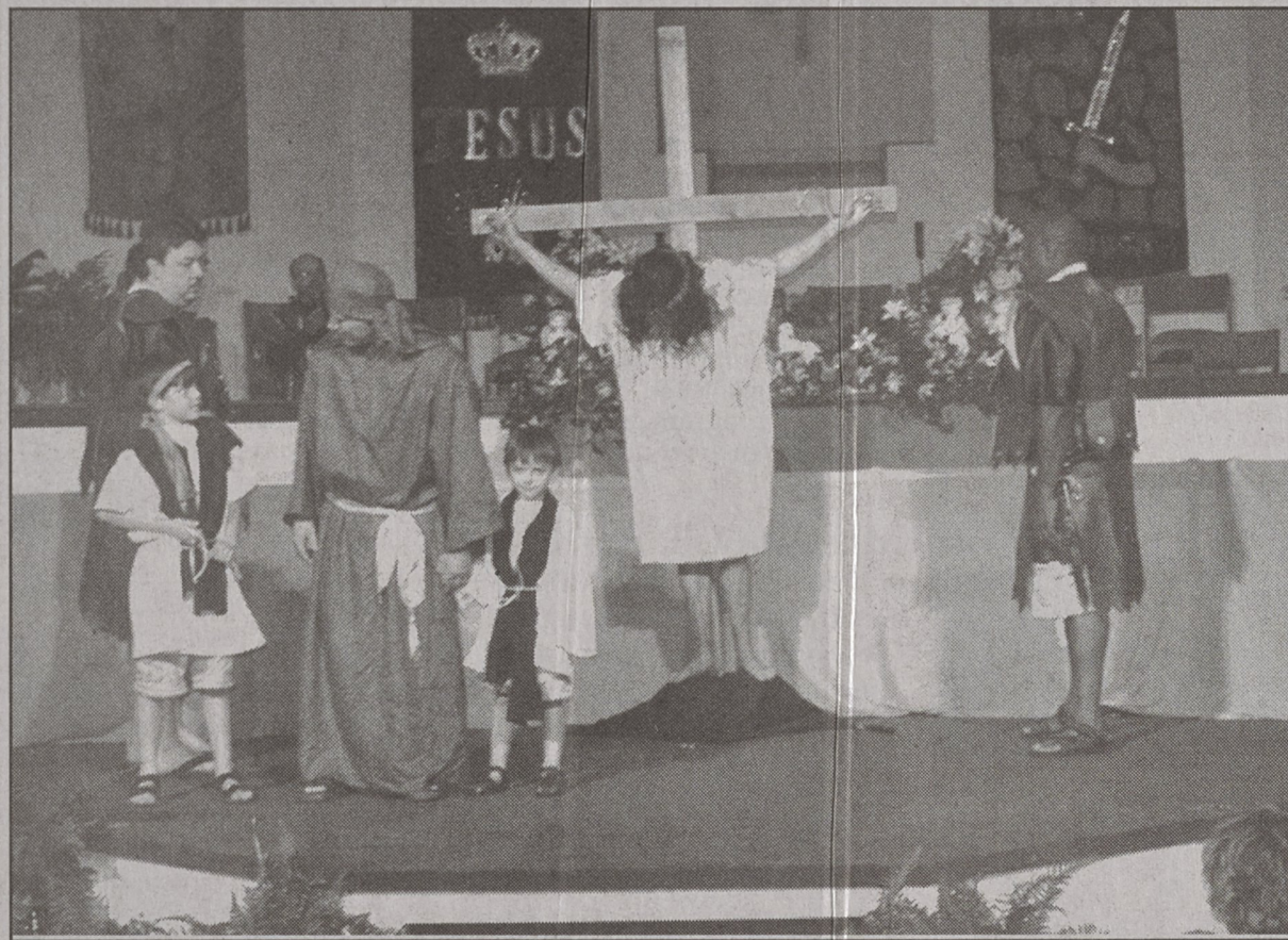
The above picture, a dramatization of the crucifixion of Christ was taken during the Easter Sunday morning service at Kings Mountain Family Worship Center Church of God.