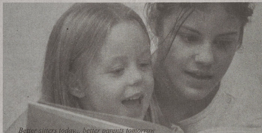
Better sitters today... better parents tomorrow

Training Adolescents for Safer Child Care