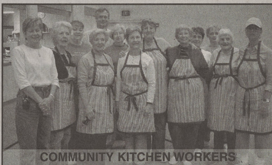
COMMUNITY KITCHEN WORKERS

CHURCH BRIEFS DEADLINE Deadline for church briefs is 12 noon Monday. Bring them by The Herald at 824-1 East King St., call 739-7496, fax 739-0611 or Email gstewart@kingsmountain-herald.com. When space is limited, only the events coming up during the current week will be published.