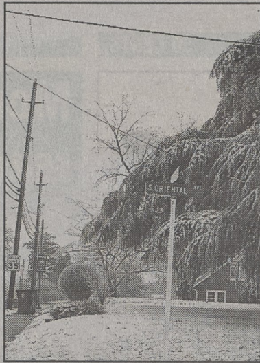
It was a winter wonderland as Kings Mountain celebrated its first snow of the year.