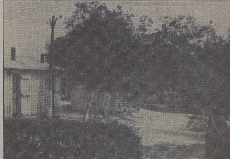
PAYSEUR SERVICE STATION