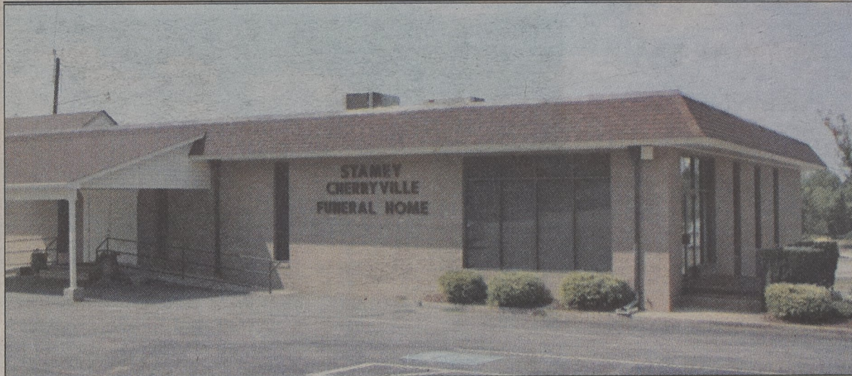
TOP: STAMEY CHERRYVILLE FUNERAL HOME