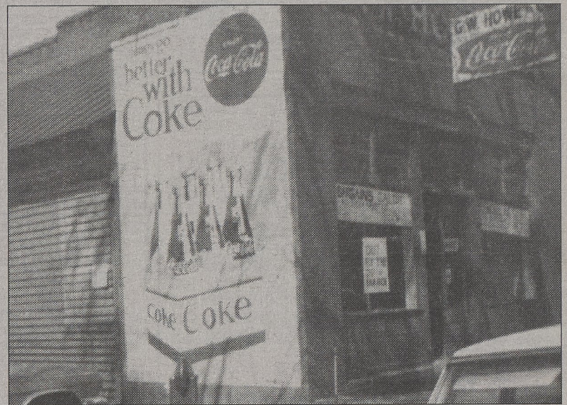
G.W. HOWE Co., Belmont