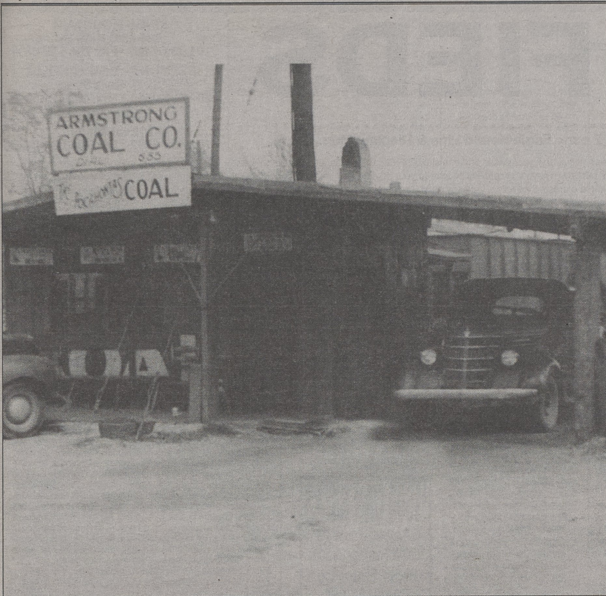
ARMSTRONG COAL Co., Belmont