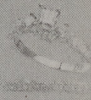
14K Solitaire 1 Carat total weight $2,200 Band $649

ARNOLD'S Jewelry & Gift Gallery MASTER JEWELER