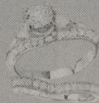
14K Solitaire 1 1/2 Carat total weight from $3,995 Band $749