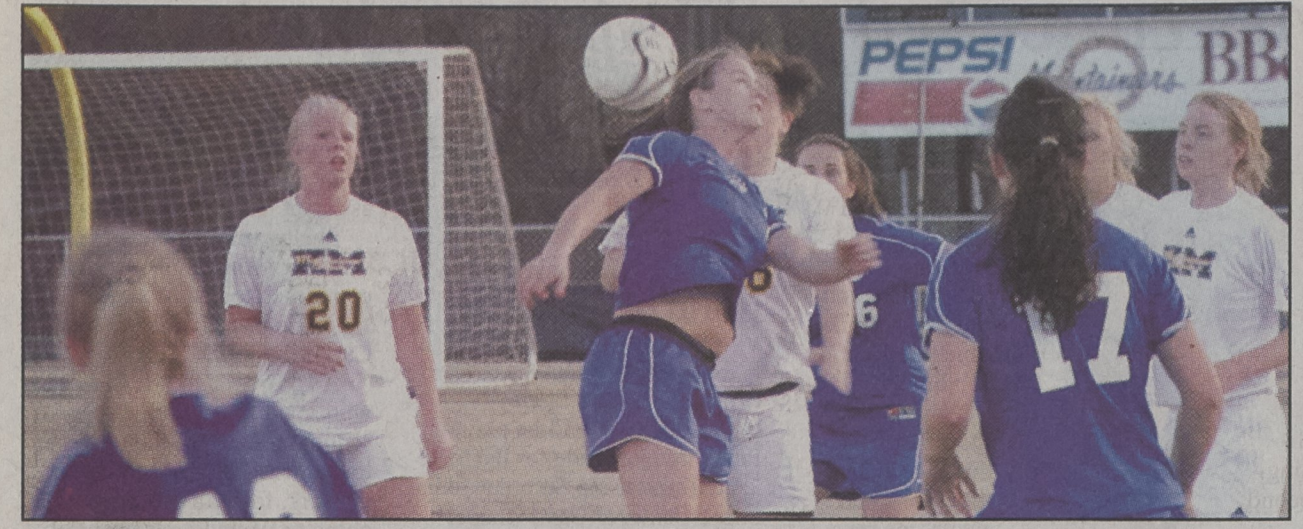
Kings Mountain and Polk County players battle for control of the ball in season-opening non-conference soccer game Monday night at KM's John Gamble Stadium.