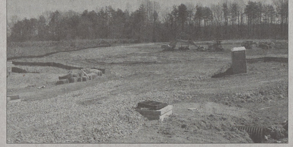
Construction is underway at the future site of the Kings Mountain Hospice house on Kings Mountain Boulevard.

Chemetalle Foote, of Kings Mountain. 348 Holiday Drive, is putting up a cooling tower and compressor estimated to cost $427,000, according to a commercial/mechanical permit issued by the City