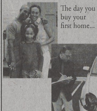
The day you buy your first home...