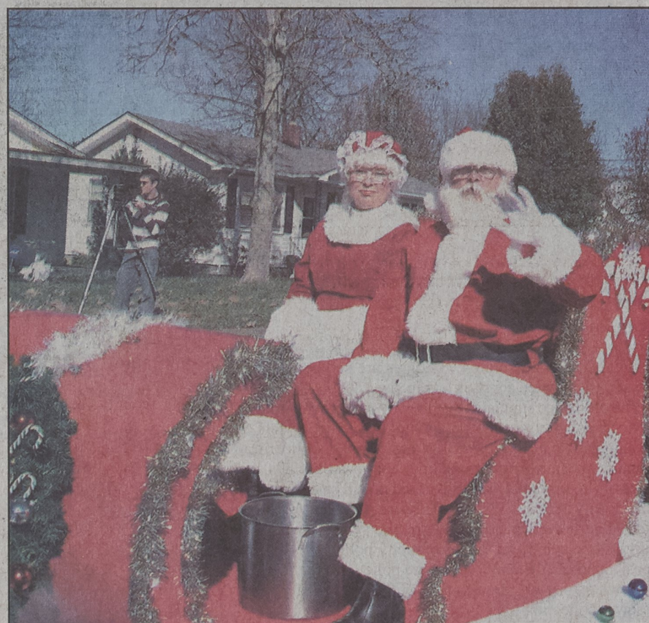
MR. AND MRS. CLAUS -- Santa and Mrs. Claus were stars of the annual Grover Christmas parade Saturday.