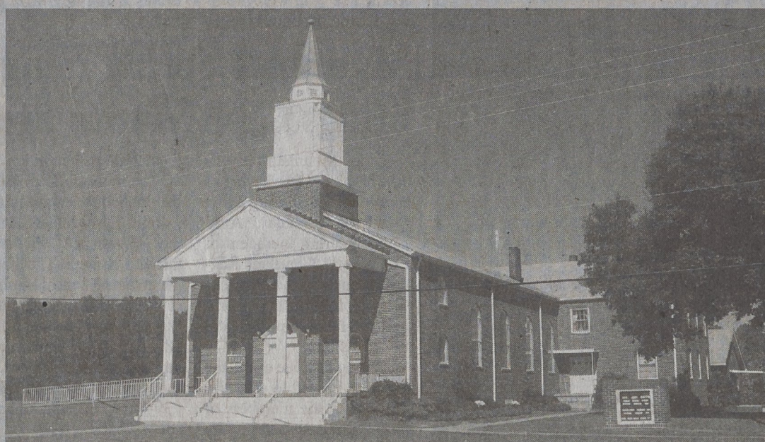
Featured Church of the Week: