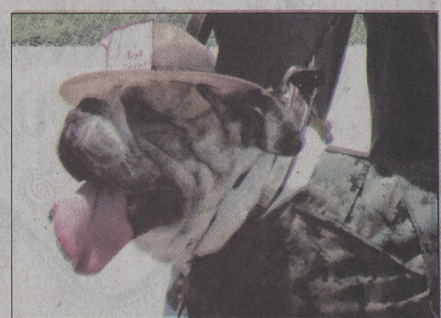
Bessie Blanton's "Moose" took top prizes in the Best Dressed and So Ugly It's Cute contests in the pet expo.