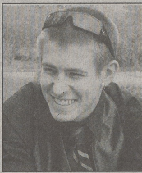
for transplant-related expenses.