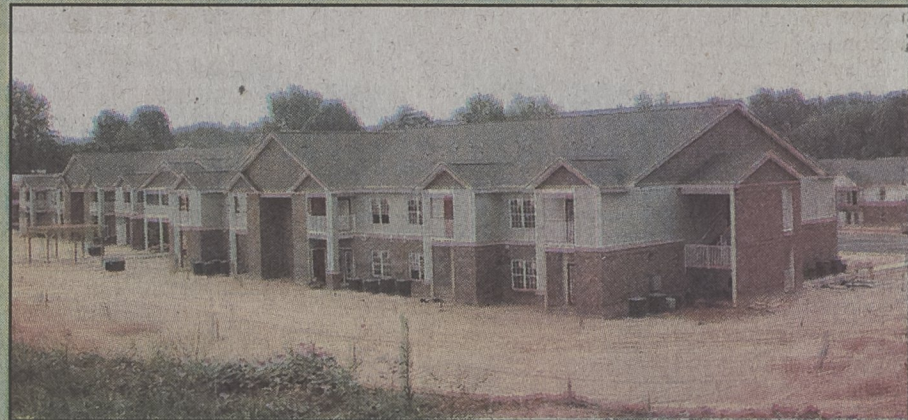
The 84-unit E. Gold Street apartment complex is springing up nicely. Construction workers for Pendegraph Company of Greensboro have been working at the site and have made a lot of progress since March when foundations were being poured and walls were just starting to go up. As seen in the photograph taken Tuesday morning, several units are already up and finished (from outside appearances) and parking lots are being formed. The new housing, expected to be completed this year, will provide 38 units for senior citizens.