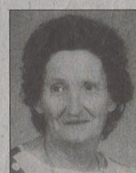
Kings Mountain Hospice House. She was born in Union County, SC, on Feb-