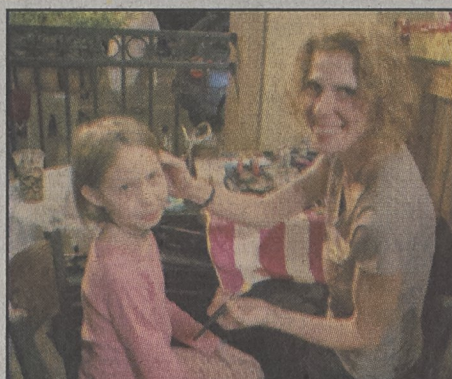
"Jammin' for Wishes" benefit Friday night. She donated her services and offered her tips to the event, which raised money for the Make-A-Wish Foundation.