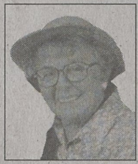
and her five brothers and three sisters helped support the family