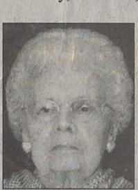
White Oak Manor in Kings Mountain.