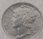
1916 Mercury Dime PAID $2,800