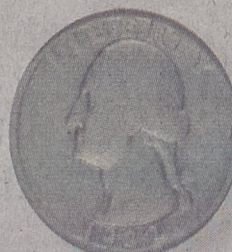
1932 Washington Quarter PAID $250