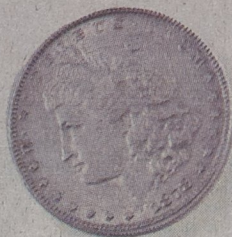
1893 Morgan PAID $1,800