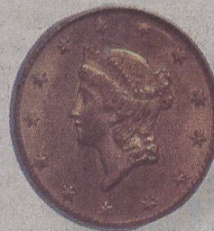
1849 Gold Dollar PAID $8,500