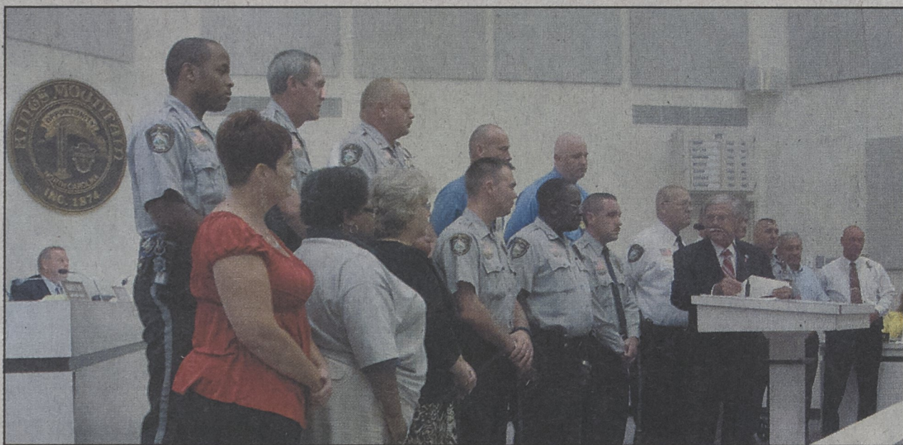
Members of the police department attending a city council meeting.

Kings Mountain's Night Out Against Crime Tuesday was an annual effective, enjoyable program promoting neighborhood spirit and police and firemen community partnerships in a fight for a safer America.