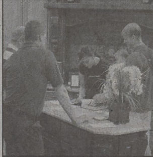
HGTV'S JOHN GIDDING