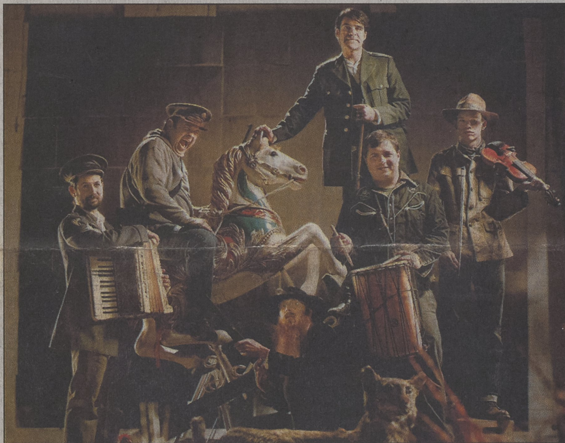
Overmountain Men band to headline concert at Gateway Festival.

Big plans are in the works by the City of Kings Mountain, host of the annual "Gateway Festival," to be held Saturday, October 8 from 10 a.m.-6 p.m. throughout the downtown area.