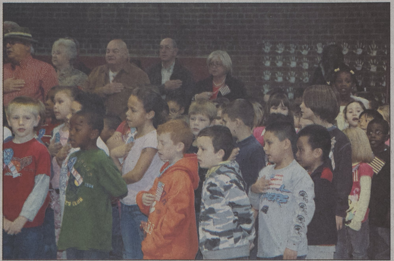
At right: Grover students pledge allegiance to the flag.