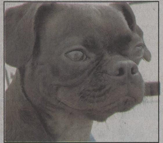
Rocco is a Frug (a French Bulldog Pug) rescued three years ago from a puppy mill. She now lives in KM.