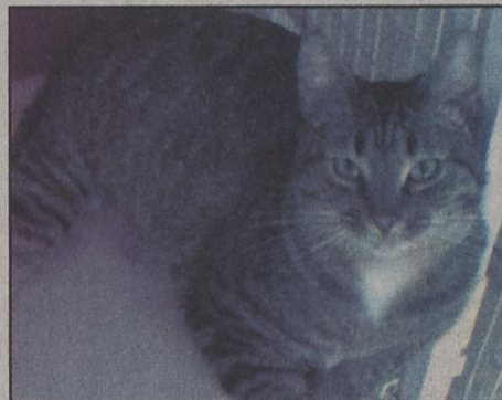
Angelica - Tabby, Grey

The shelter currently houses dozens of cats and dogs wishing for a home and a family to love them this Christmas.