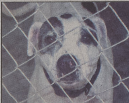
Petie - Boxer/Dalmatian Mix

So before you see that sweet face and make an impulse buy, remember a pet is a lifetime commitment. Make sure you are physically, mentally and financially ready to take home that bundle of joy. The pets need that commitment too.