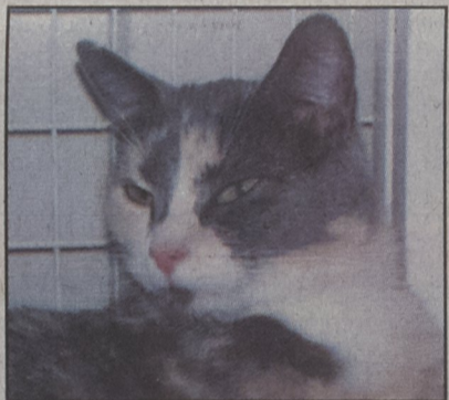
Frannie - Calico Mix