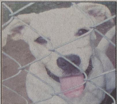
Willie: Labrador Retriever