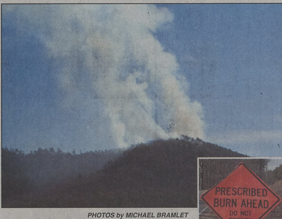
Smoke rose from Crowders Mountain Monday as crews con-

ducted a prescribed burn to help promote forest growth.