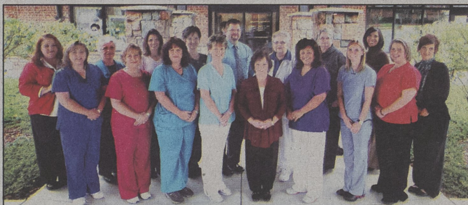
The Shelby Eye Center team looks forward to taking care of your eye care needs.