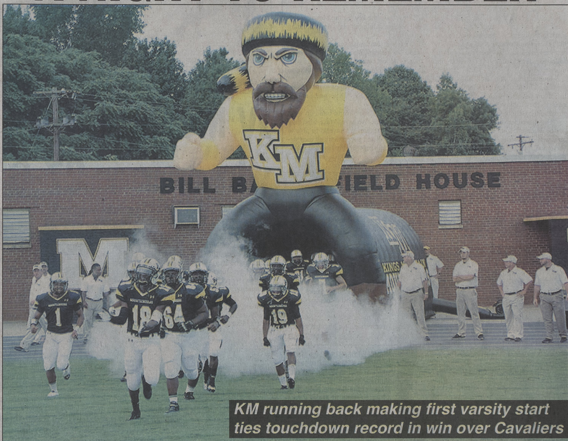
KM running back making first varsity start ties touchdown record in win over Cavaliers

Kings Mountain's Mountaineers entered Gamble Stadium for Friday's game through a new smoking Mountaineer blow-up mascot which was a hit with players and fans.