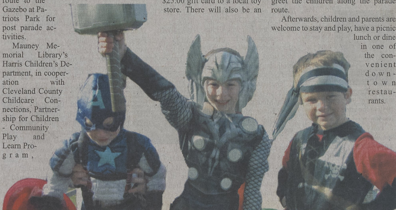
These superheros marched in the 2011 Great Pumpkin Halloween Parade.

Afterwards, children and parents are welcome to stay and play, have a picnic lunch or dine in one of the convenient downtown restaurants.