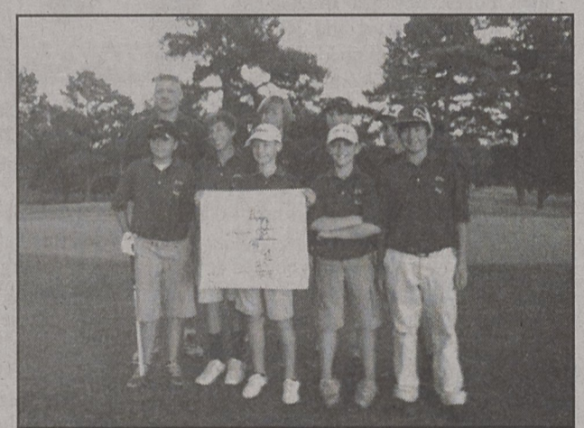
Kings Mountain Middle School's golf team won the annual Tri-County Conference championship match last week at River Bend.

Kings Mountain had earlier won the Cleveland County championship at Deerbrook.