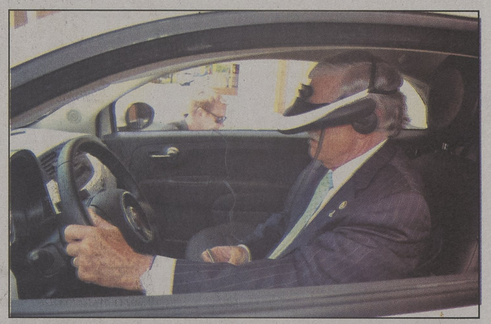
Mayor Rick Murphrey, in driver's seat, passes the driving test.