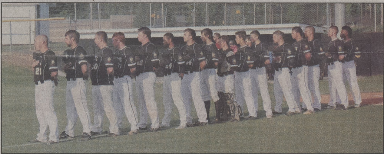
Kings Mountain Post 155 coaches and players face the flag during the playing of the National Anthem prior to Sunday night's game with Queen City at Lancaster Field.