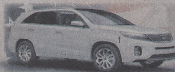
2013 Kia Sorento