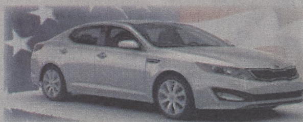
2013 Kia Optima