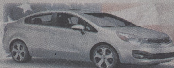
2013 Kia Rio