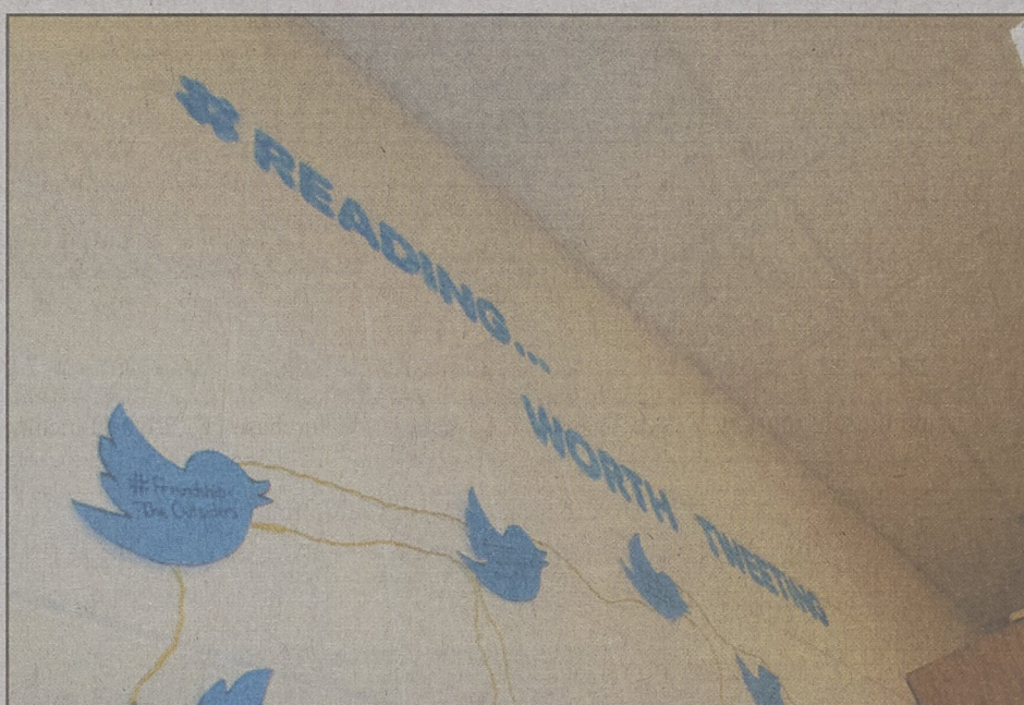
Above: Tweet this book. A display in the library of the new Turning Point Academy suggests an intersection between books and social media. Turning Point Academy, the system's alternative school, shares a campus with Cleveland County Schools main administration building.