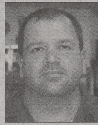
Oh, yeah. I'm taking my daughter. She likes everything about it. The rides, the games, everything.