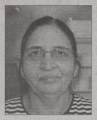
Yes, we'll go. It's new for us. We just moved here last year (from Charlotte). The pig race will definitely be new to us.

The Cleveland County Fair starts tomorrow. Do you plan on going this year?