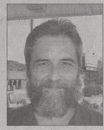
We usually go. (My family) likes to go because of the food. You run into people you know.