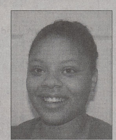
Yeah, my favorite thing has got to be the food.